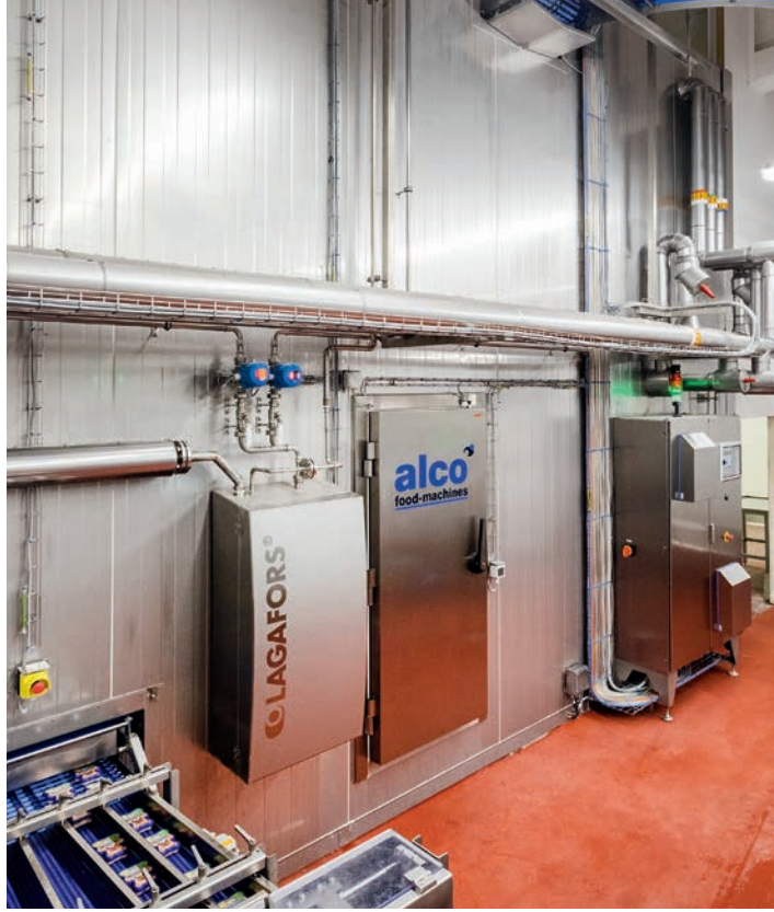
The spiral cooler at Reinert can cool goods from 76 °C to 5 °C over a number of 35,5 tiers.