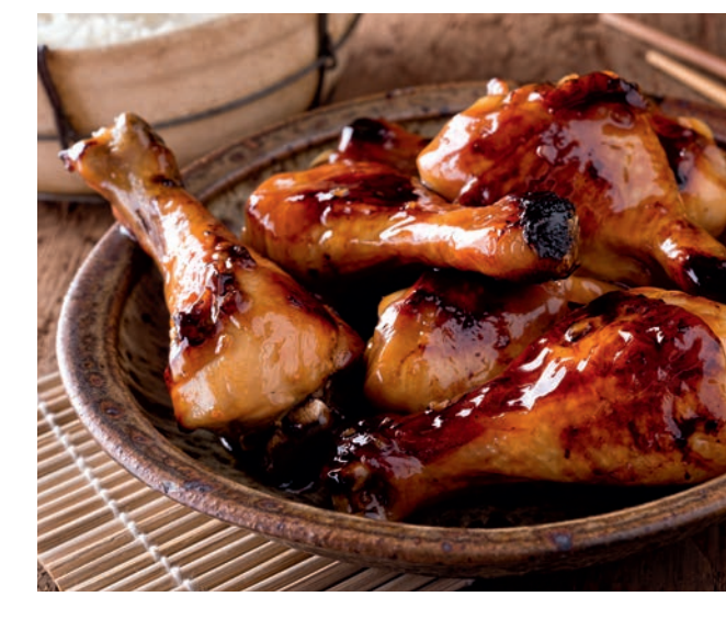
Crispy outside, tender inside. Our Dual Cooker system is especially suitable for the preparation of bone-in products. It will cook reliably and ensure an appetizing appearance for your products.

The machine hood can be lifted electrically and simply using a four-column, spindle lifting system.