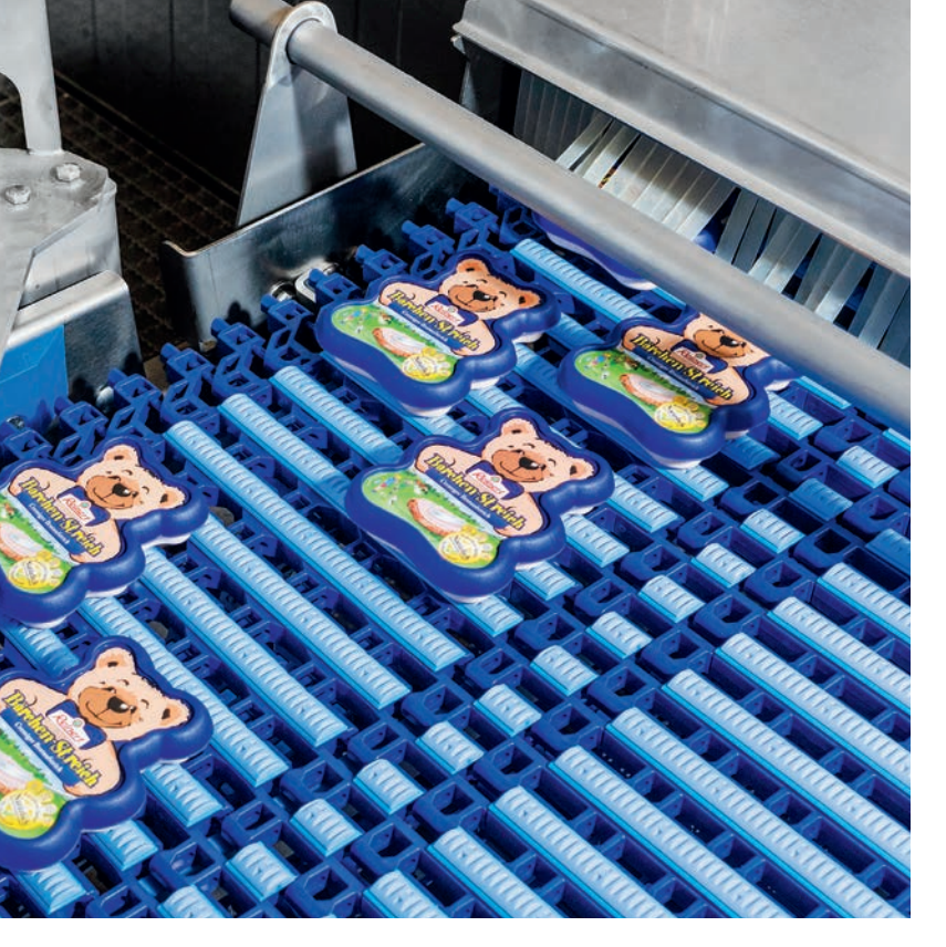
A belt with a special rubber coating as well as the DirectDrive system ensure the conveyor will run smoothly and keep the products in their positions.

Are you looking for machines to standardize or to further process food? Our product portfolio offers a variety of other machines for processing your products. Have a look at alco-food.com/en/machines